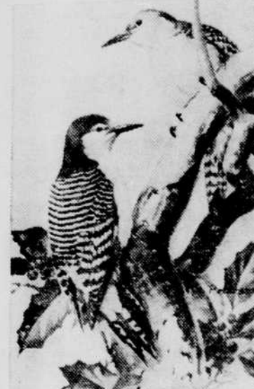
RED-BELLIED WOODPECKER