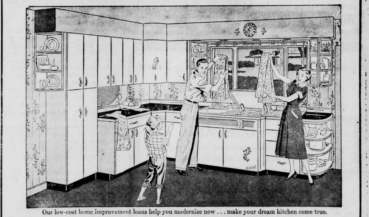
Our low-cost home improvement loans help you modernize now... make your dream kitchen come true.

For Your Corsages AND CUT FLOWER ARRANGEMENTS CALL AT OUR DOWNTOWN STORE IN THE ECKLES BUILDING OUR PLANTS "IN YOUR GARDEN" WILL GIVE YOU FLOWERS ALL SUMMER See Our Selection ART'S GARDEN CENTER On U.S. 70 Across from Sarg's DIAL 7525 FOR BOTH STORES