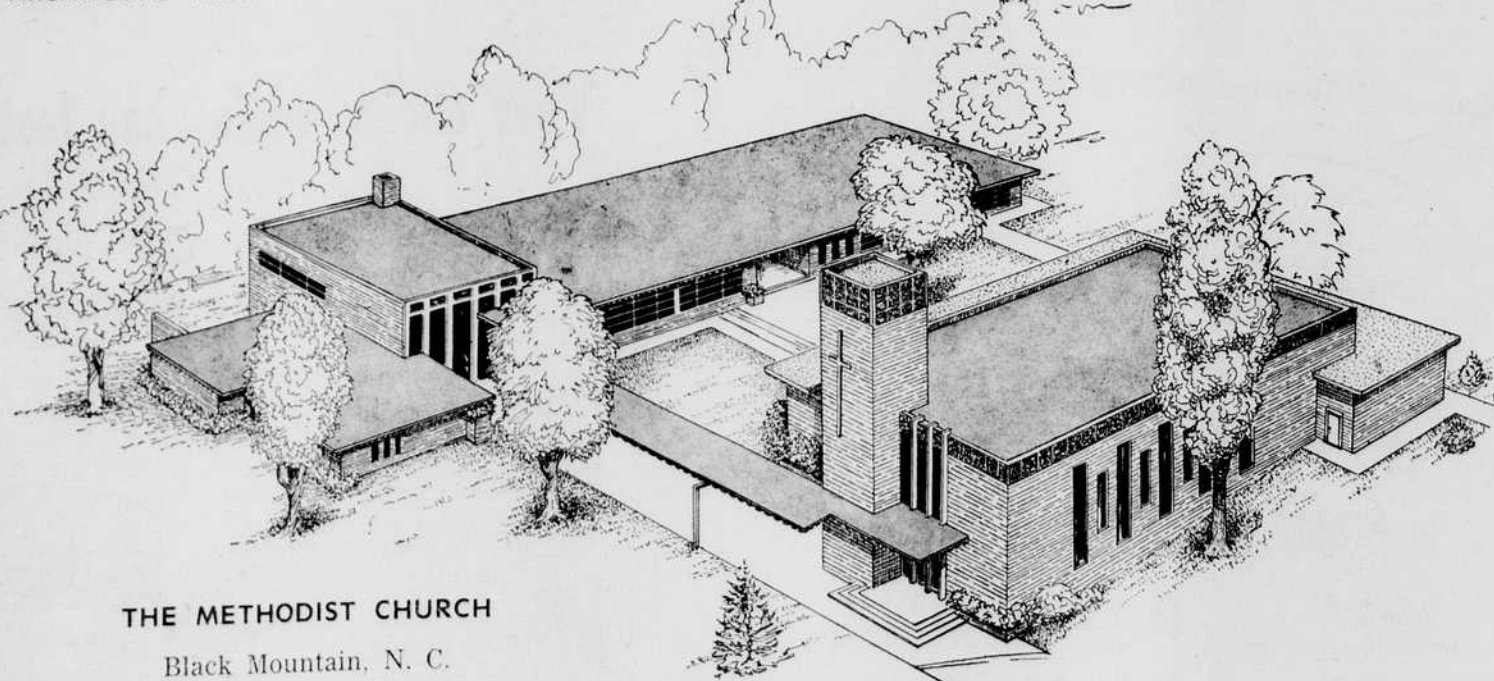
THE METHODIST CHURCH Black Mountain, N. C.