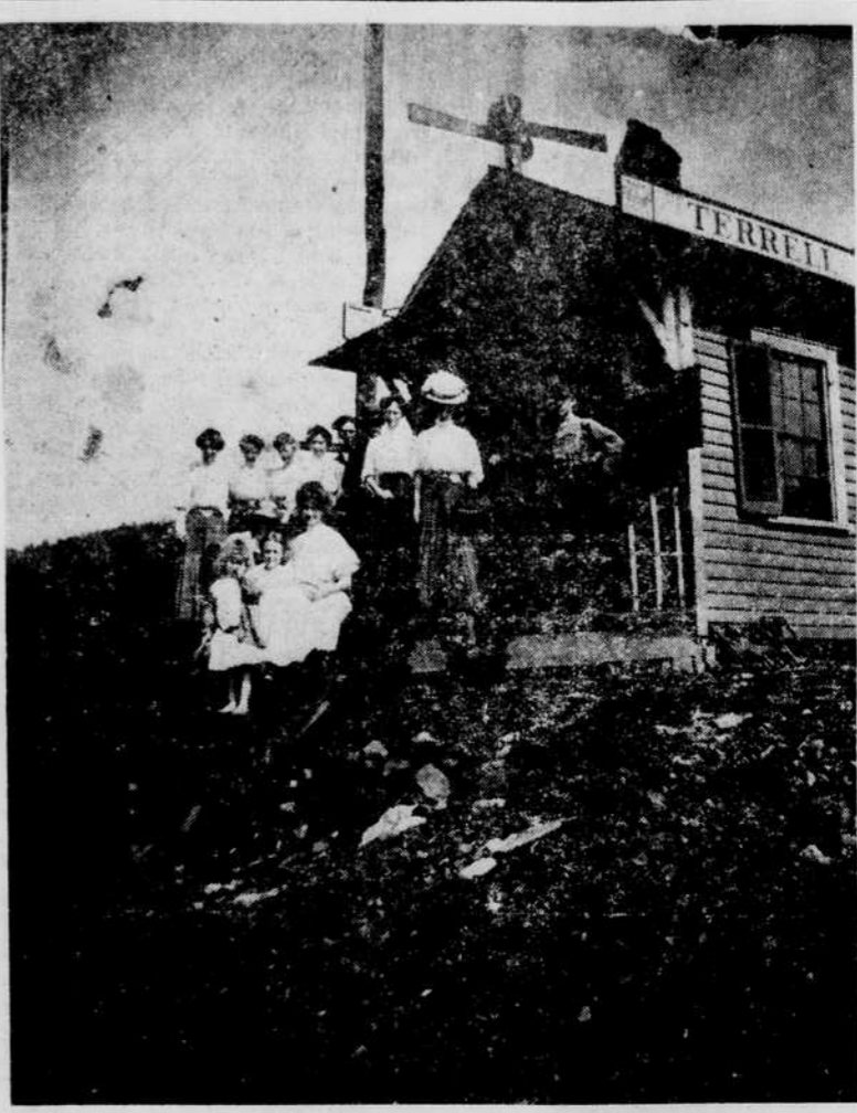
Can you identify this railroad station?