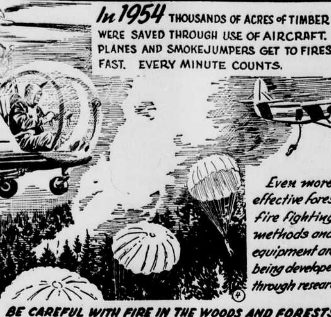
In 1954 THOUSANDS OF ACRES OF TIMBER WERE SAVED THROUGH USE OF AIRCRAFT. PLANES AND SMOKEJUMPERS GET TO FIRES FAST. EVERY MINUTE COUNTS.

1919 PIONEER GENERAL H.H. (HAP) ARNOLD made the first observation flight over a forest fire for the U.S. Forest Service.