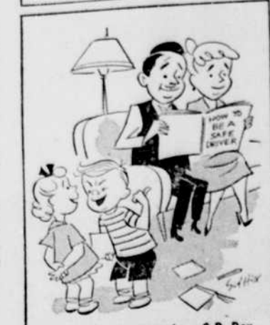
"It's their homework - S-D Day is coming up December 1st!"