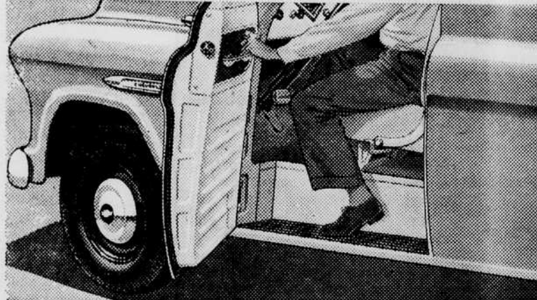
Watch your Step! Look for new CONCEALED SAFETY STEPS—a mark of today's most modern trucks that new Chevrolet Task-Force trucks bring you. They stay clear of snow, mud and ice to give you firmer, safer footing.