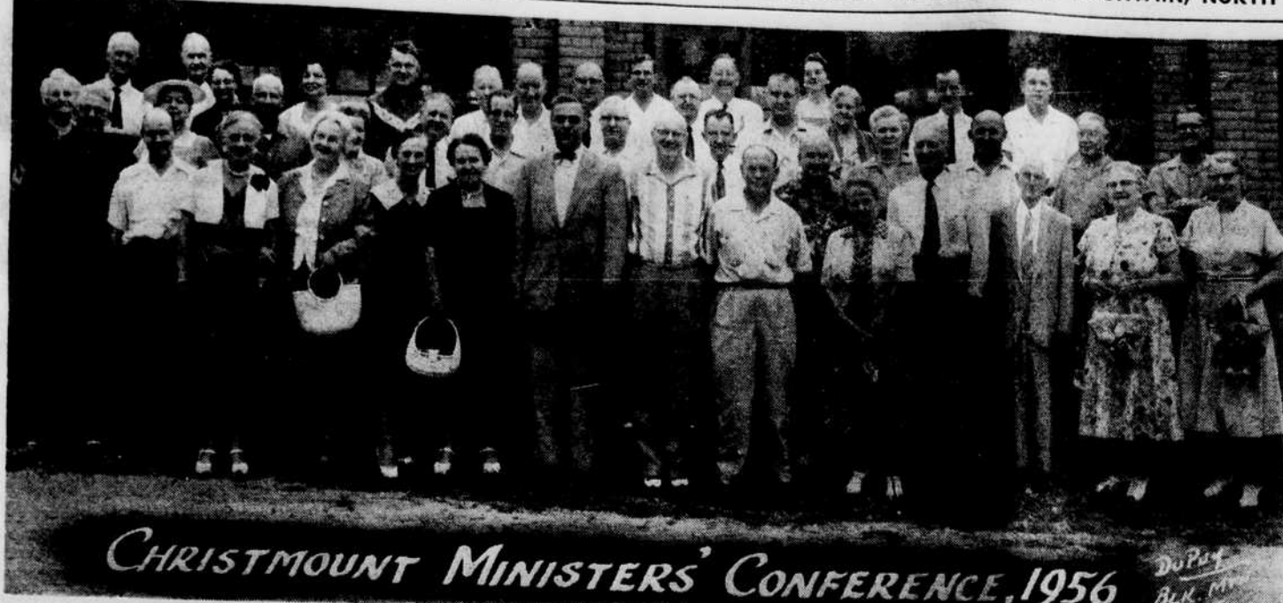
CHRISTMOUNT MINISTERS' CONFERENCE, 1956