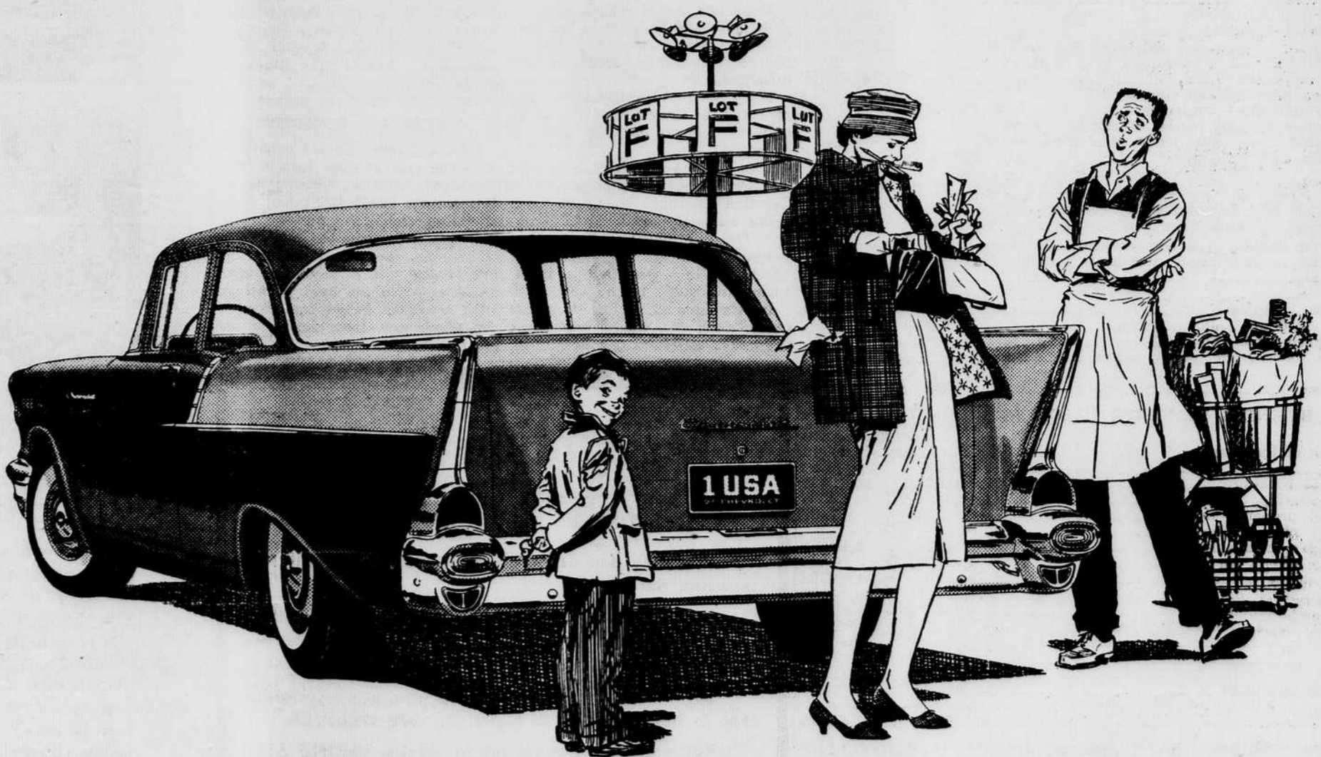
The "One-Fifty" 2-Door Sedan with Body by Fisher—one of 20 beautiful new Chevrolets for '57!