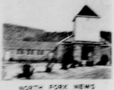
NORTH FORK NEWS