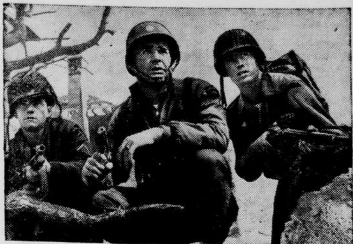
James Garner (center), "Maverick" himself, is seen in his first starring big-screen role in Warner Bros. "Darby's Rangers," a thrilling action drama of World War II, which arrives Sunday at the Pix Theatre.