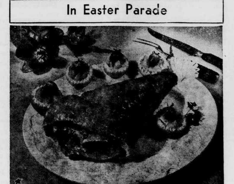
In Easter Parade

EARLY SUB EXPERIMENT "Operation Hideout" ended Mar. 19, 1953, as a group of volunteers emerged from the submarine Had-dock, in which they had been sealed for 60 days. The experiment was conducted to secure information for the planning of the nuclear submarine.