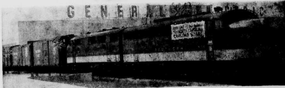
Big 55-car train leaving GE Appliance Park, Louisville, Ky. for N. C.'s Carload Sale!