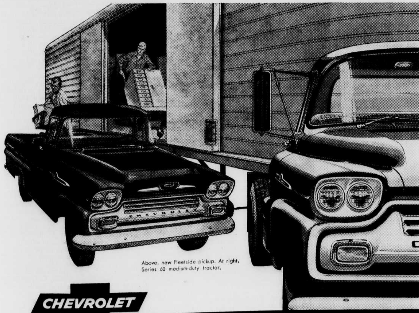
Above, new Fleetside pickup. At right, Series 60 medium-duty tractor.