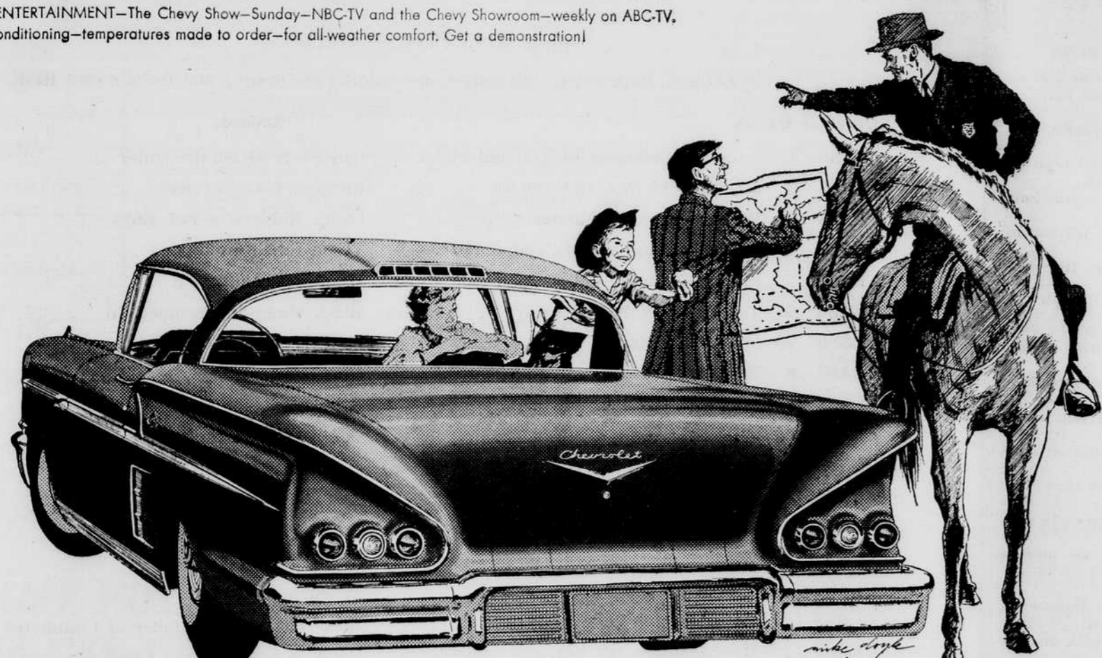
The Impala Sport Coupe with Body by Fisher. Every window of every Chevy is Safety Plate Glass.

TOP ENTERTAINMENT—The Chevy Show—Sunday—NBC-TV and the Chevy Showroom—weekly on ABC-TV. Air Conditioning—temperatures made to order—for all-weather comfort. Get a demonstration!