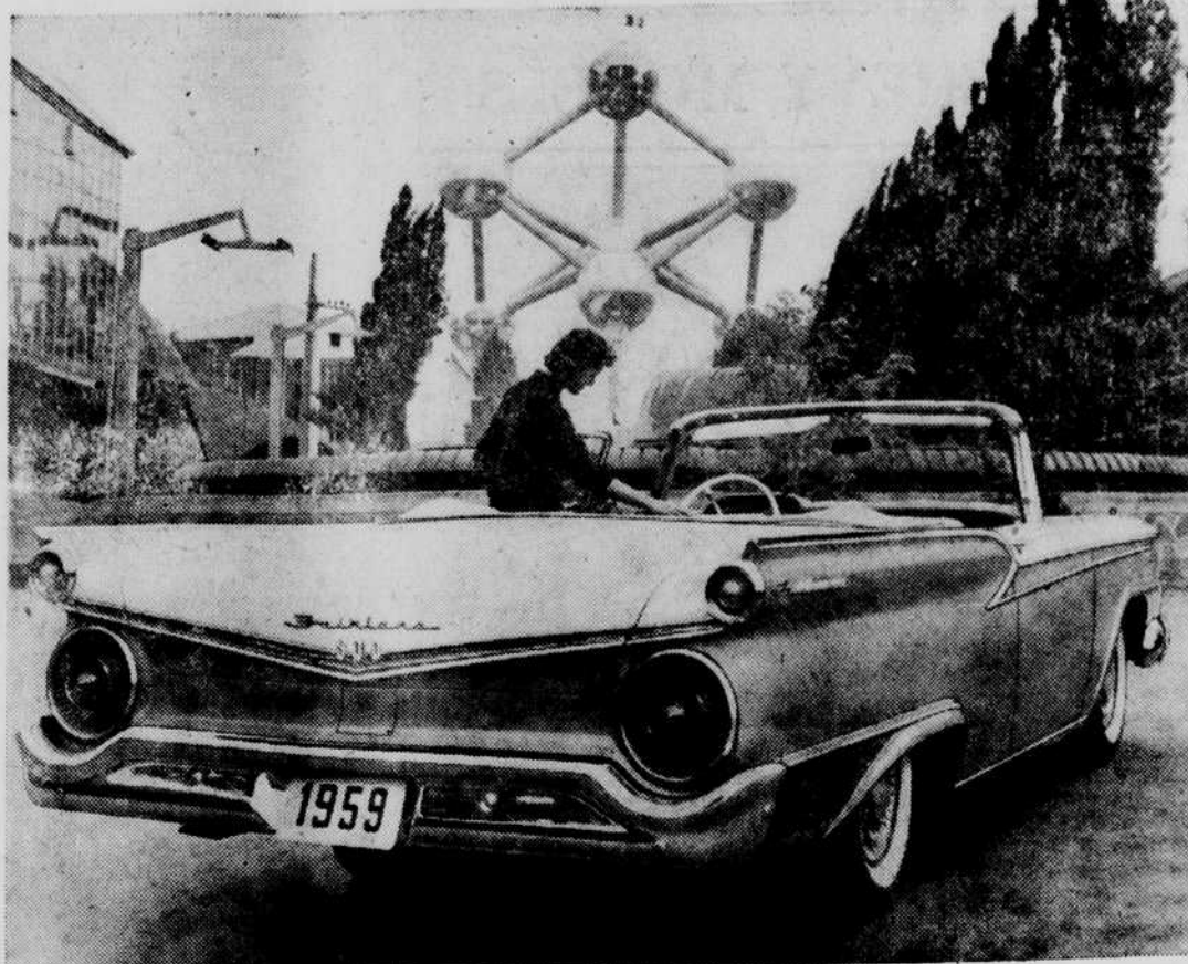
Shown in a picturesque Brussels World's Fair setting is a 1959 Ford Sunliner convertible. Ford offers two convertibles in 1959: the soft-top Sunliner and the retractable hardtop Skyliner. Ford's tasteful styling theme in 1959 is a result of consumer demand for more elegance and dignity, as opposed to gaudiness or extremism. In the background is the Atomium, prominent landmark at the Brussels World's Fair.