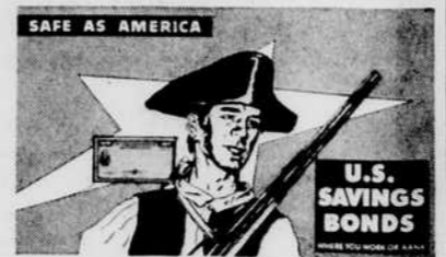
SAFE AS AMERICA U.S. SAVINGS BONDS