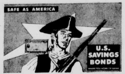
SAFE AS AMERICA U.S. SAVINGS BONDS