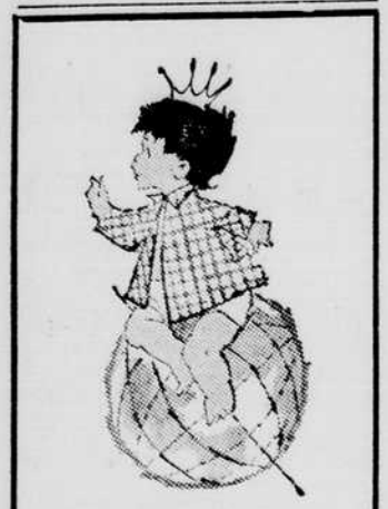
I'm sitting on top of the world because my Dad gets all of his barbering at