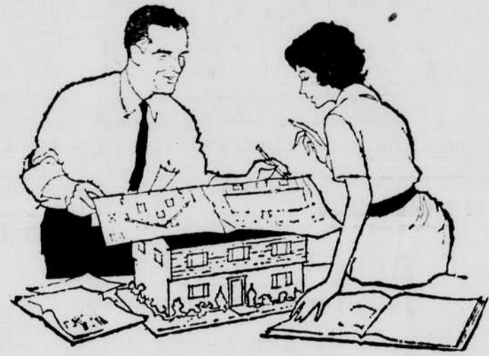
PLANNING TO BUILD? Don't go astray! Go flameless electric ALL the way!

ONLY electricity IS FLAMELESS FUMELESS FOOL-PROOF