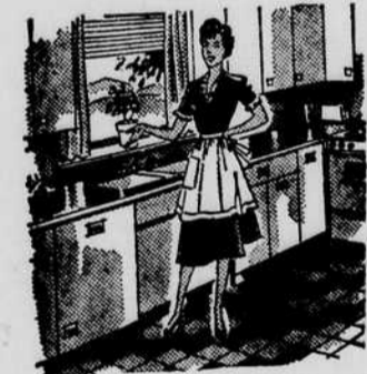
1961 - Style Kitchen?

Or other modernizing projects you want for your home or grounds?