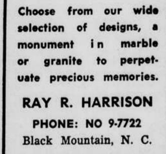
Choose from our wide selection of designs, a monument in marble or granite to perpetuate precious memories.

Those of the senior class who do not expect to attend college next fall were interviewed with the idea of their availability for labor after graduation. This does not mean that those interviewed will automatically be listed for available jobs, but it does mean that their names will be filed and upon application for a job following graduation, they will be considered for suitable va-