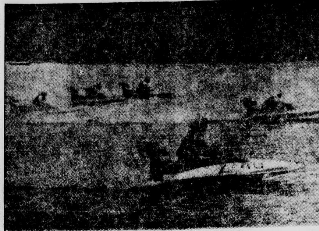
Scenes like the one above will take place at the seventh running of the Lake James Boat races to be held in the Catawba Dam-Canal Bridge area of Lake James near Marion Sunday afternoon, June 11.