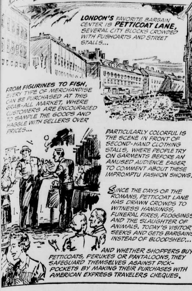
FROM FIGURINES TO FISH, EVERY TYPE OF MERCHANDISE CAN BE PURCHASED AT THIS...