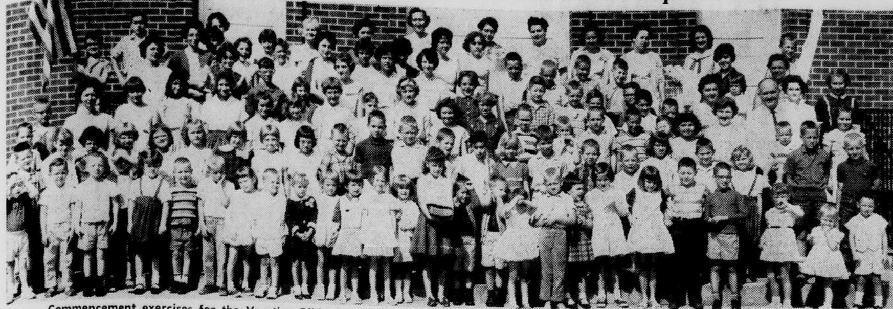
Commencement exercises for the Vacation Bible School of the First Baptist Church, Swannanoa were held Sunday night July 1, marking the end of a two-week school.