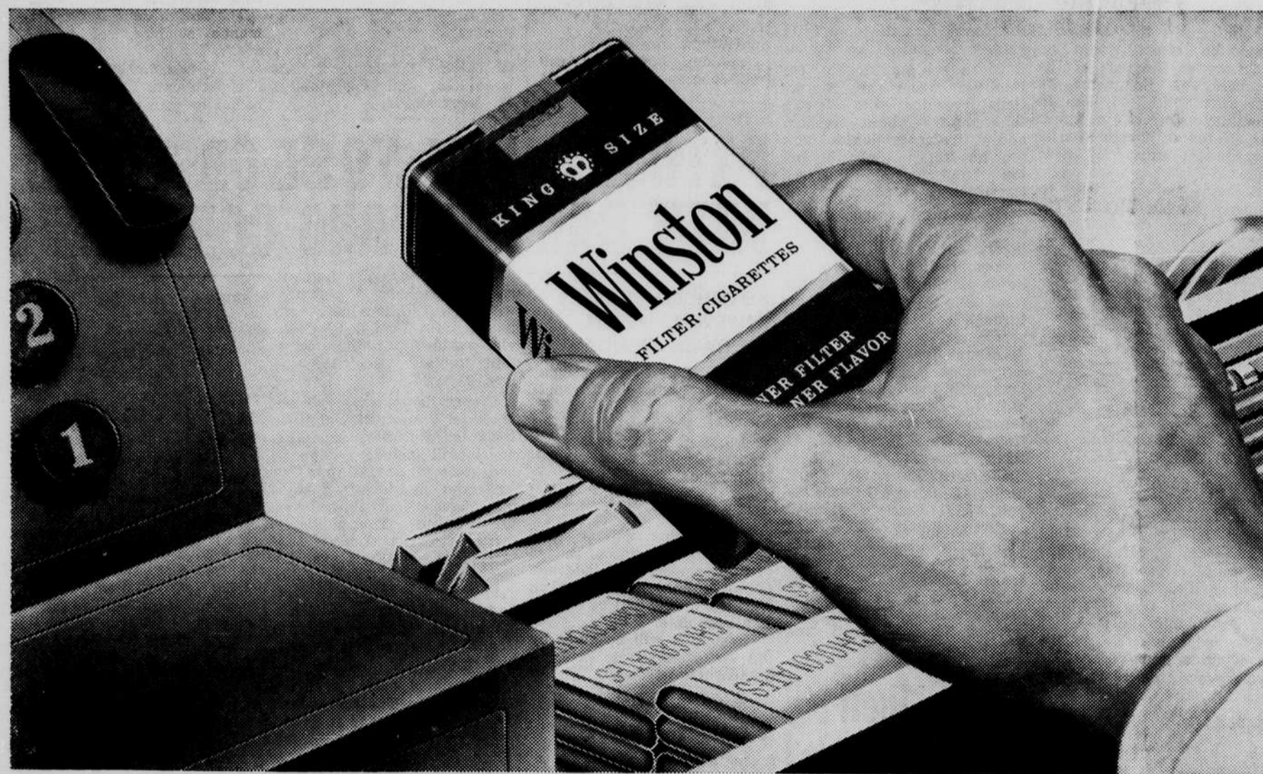
© 1963 R. J. Reynolds Tobacco Company, Winston-Salem, N. C.