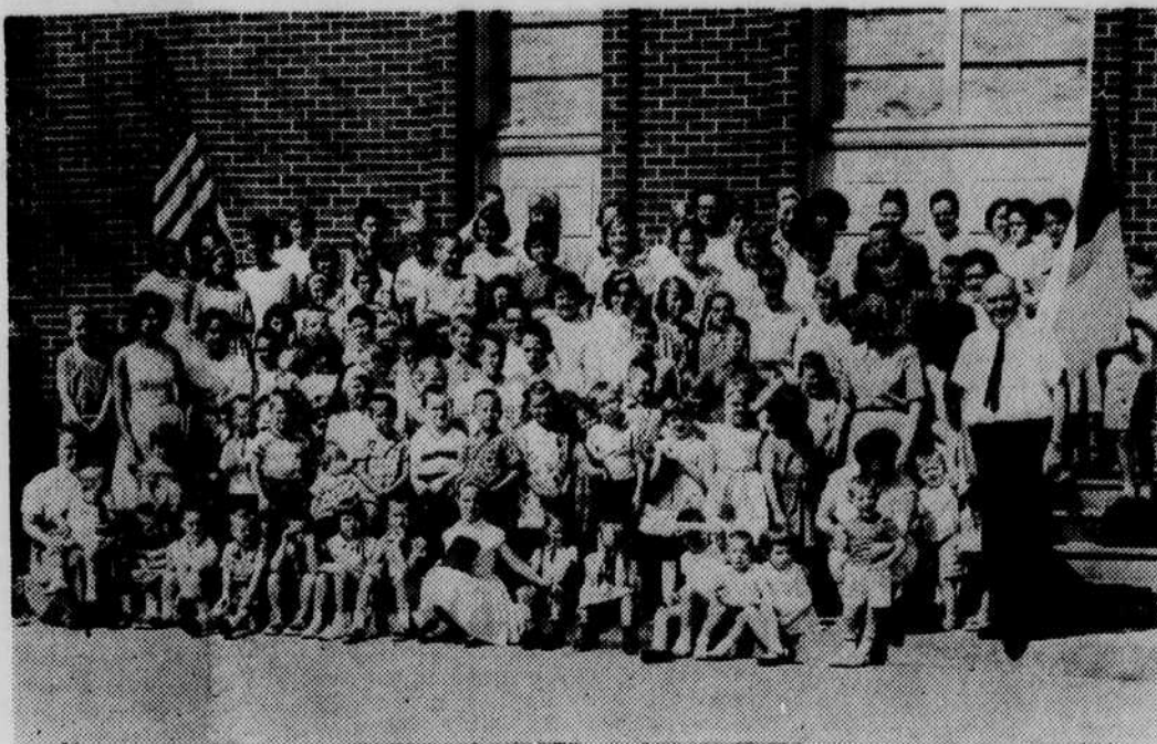
There was an enrollment of 134 in the Vacation Bible School of the Swannanoa First Baptist Church. Preparation Day was Friday, June 12, with a parade. Bible School each morning June 15-19, from 9:00 to 12:00. On the last day there was a picnic for the Bible School.