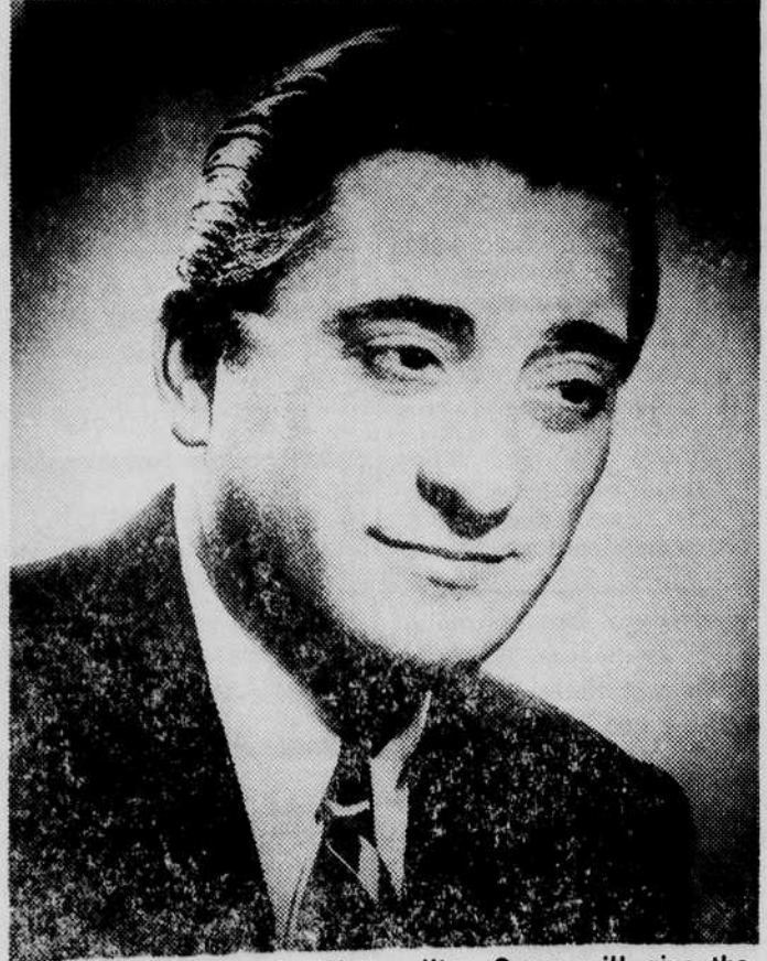
Jan Peerce of the Metropolitan Opera will give the Patron's concert in Anderson auditorium, Montreat, Aug. 15 at 8 p.m.