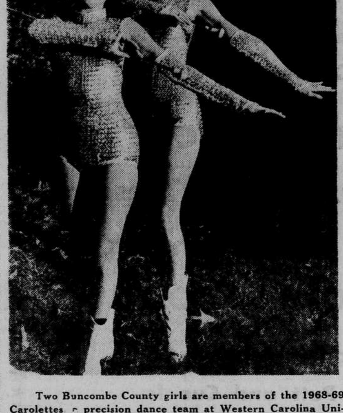
Two Buncombe County girls are members of the 1968-69 Carolettes precision dance team at Western Carolina University.