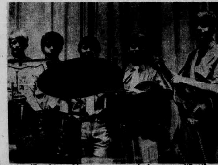
The "Looking Glass", winner of the state "Battle of the Bands"