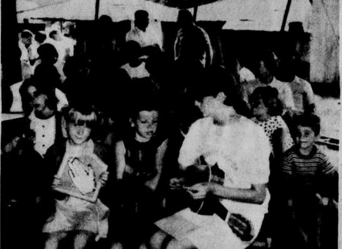
A typical scene at the Missionary Camp is one of fun for the participants.