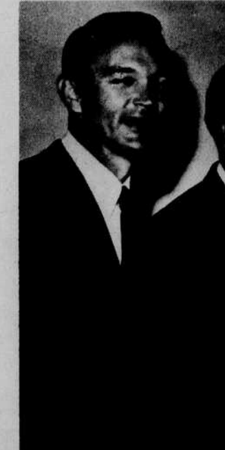
astronauts Mike Collins (left), Neil Armstrong (shaking hands) and Buzz Aldrin following their recent appearance before a joint session of Congress.