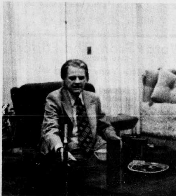
DR. GRAHAM displays millionth printed copy of "Angels God's Secret Agents."

of the conference. Dr. Graham plans three major Crusades in the United States in 1976; one in Seattle, Washington, one in San Diego, Calif., and one in Detroit.