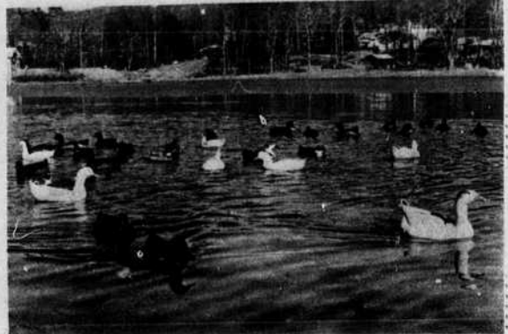
HAPPY - TOGETHER - SWIMMING FREE.