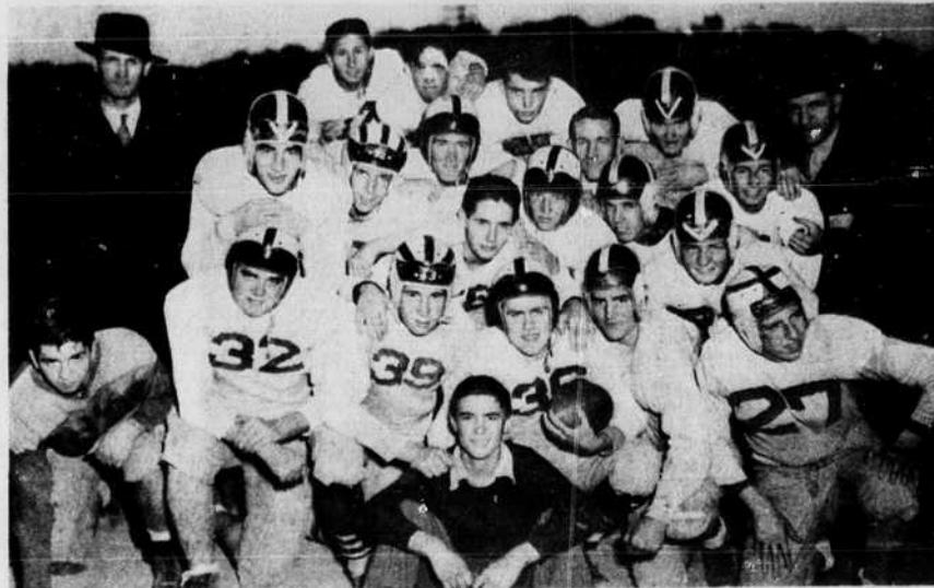
DO YOU REMEMBER? This is the 1940 Swannanoa High School Football Team. Can you name the players and coaches?