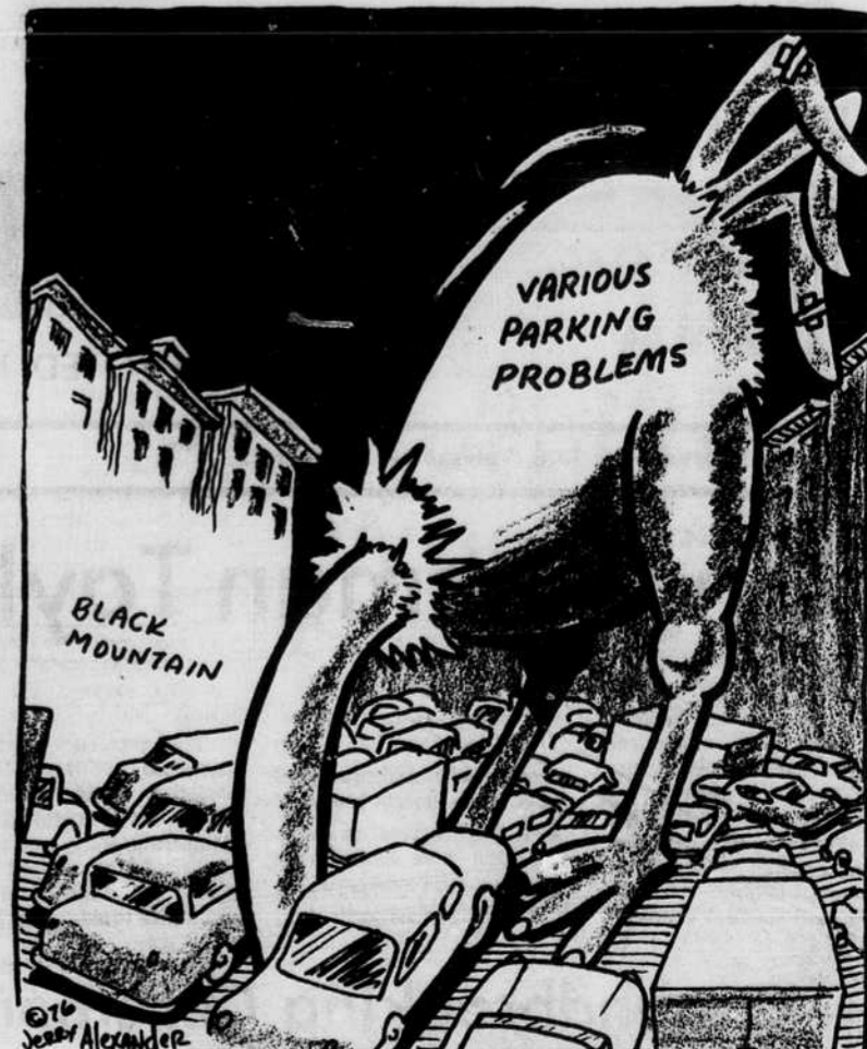
SOMETIMES HARD TO SEE