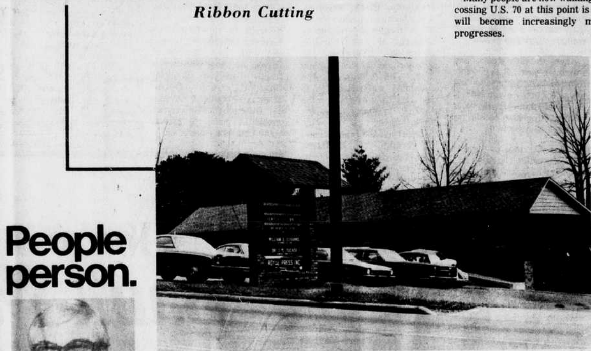
Executive Plaza Building