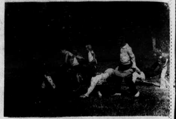
THESE STUDENTS often fell and toppled over each other as they raced with their partners toward the finish line in the wheelbarrow race

second, and third place ribbons were given to the winners in the 17 areas of competition. The events which were held included tug-of-war, 50 yard dash, softball throw, shotput, potato sack race, three-legged race, and wheelbarrow race. Sportsmanship was the major theme of the Junior Olympics this year. Out on the slightly soggy ground, the students cheered and rallied together to win their designated events. Without a doubt, this year's Junior Olympics generated unity, sportsmanship, and an outlet of recreation for the students at Swannanoa School.