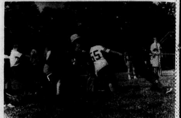
TWO OPPOSING SQUADS pit their strength against each other in the classical tug-of-war competition.