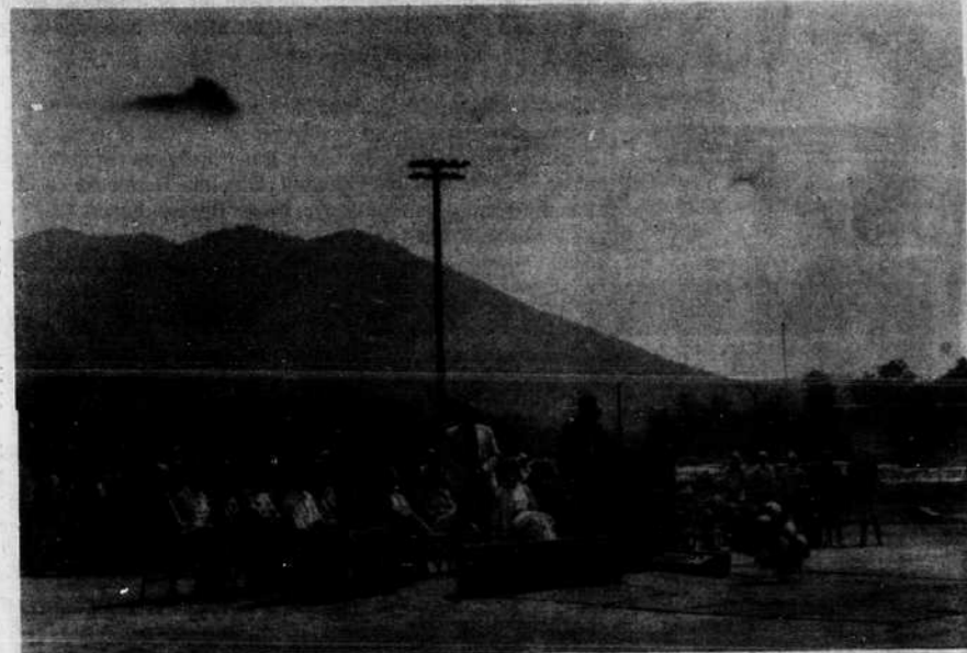
THE CHARLES D. OWEN PARK Opening ceremonies were held Saturday, May 22. The speakers were flanked on both sides by the Babe Ruth League ball players, who played their first games that afternoon.

Lunch was served at about 12:30 for $1.00 a plate. Afterwards, the Babe Ruth League games got underway and continued for the rest of the afternoon.