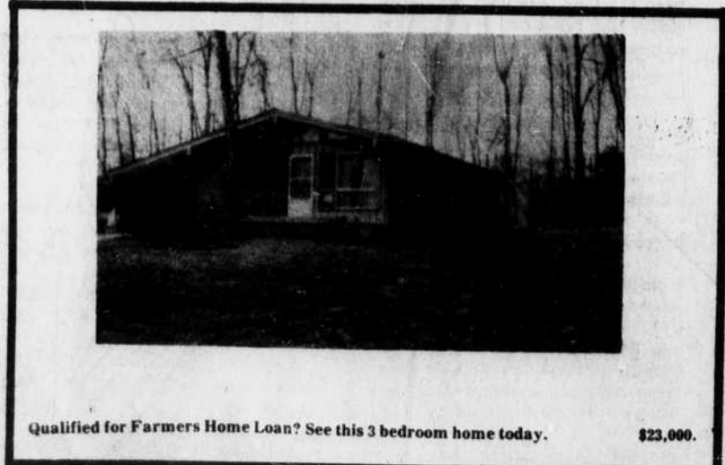
Qualified for Farmers Home Loan? See this 3 bedroom home today. $23,000.

East Buncombe's Largest Builder of National Homes