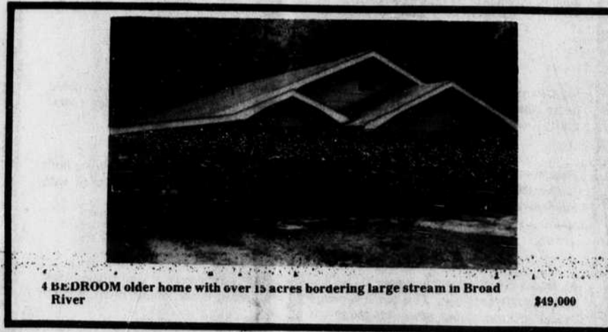
4 BEDROOM older home with over 15 acres bordering large stream in Broad River $49,000