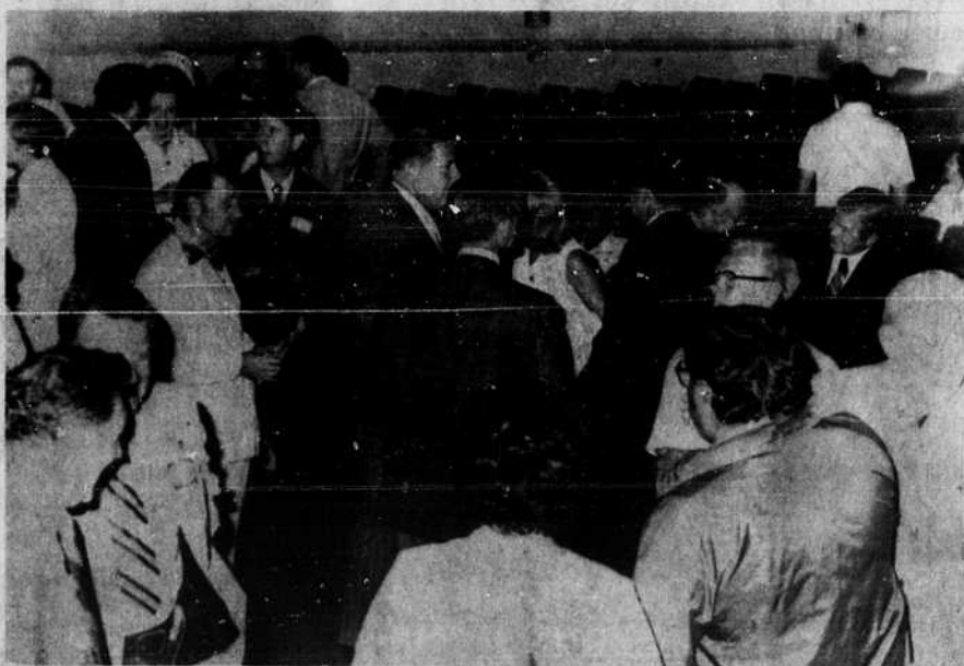
POLITICIANS FROM ALL over the valley came to the Democratic Rally at Owen High School Saturday night to mill around with the crowd and express and exchange views.