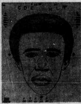
Suspect No. 2

Black male 6' to 6'1", weight approximately 250 lbs. Long side burns, abbreviated Afro, mustache, heavy eye brows, hunting knife in belt.