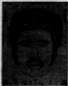
Suspect No. 1

The pictures shown above are a police composite of the two men who attempted a robbery of the Mr. Zip Store at State Street and Craigmont Road, Black Mountain on Wednesday Oct. 13 and returned on Sunday to complete the job.