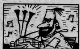
The bagpipe is not originally Scottish, but Persian.

The show will feature displays and live demonstrations in many categories. There will be open competitions for restaurant, hotel and motel cooks, institutional cooks, student cooks and retail bakers. Judging will be conducted by professional chefs and prizes and certificates will be awarded.