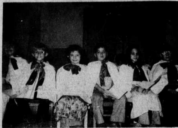
The members of the choir sang joyously all through the program.

It was the custom on Christmas Eve for all the people to bring their gifts for the Christ child to the church, and when the greatest and best gift was laid on the altar, the music of the chimes could be heard through the church. For many long years they had not been heard. People had become careless of their gifts - each one trying to bring some better gift than the other, without giving anything that he wanted for himself. No gift was great enough for the chimes to ring until Pedro and Little Brother gave a little silver piece from their own pockets. This set the beautiful chimes ringing because it was a true gift from the heart.