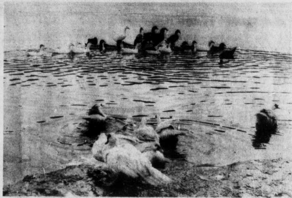
Can We Protect These And Other Helpless Creatures??

However, the time has come when we have to put up or shut-up. We as citizens will have to make known, if possible, the owners of the dogs creating the havoc. Folks around the Lake are trying their best to protect the ducks, but there have been many other animals killed by these roving packs all over