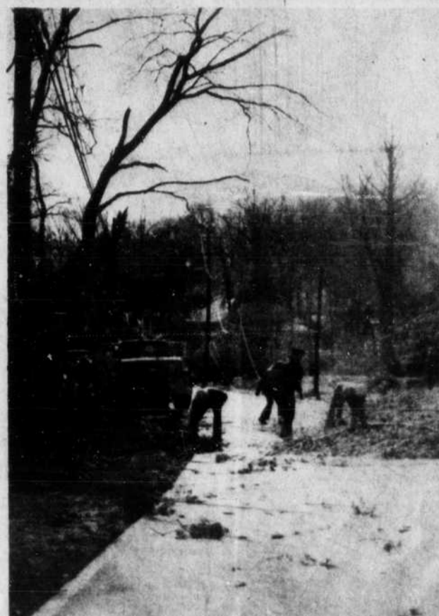
MEMBERS OF CP&L clean up debris from a tree which fell across a power line on Montreat Road Saturday at 1:04 p.m. disrupting power in a large area of Black Mountain. Power was off from 45 minutes to one and a half hours. CP&L workmen were aided by the Black Mountain Fire and Police Departments.

Local contractors have finished work on the upper level of the Community Center at Lake Tomahawk. The renovation has been a major undertaking involving replacement of paneling and floor tiling, a new placement of doors, and structural changes in the basement which will leave the whole area open for activities. The construction has been particularly sensitive to the needs of Senior Citizens. A new access road will make transportation to the door possible and ramps in and out of the building will increase safety and mobility; these features are very important since one of the primary clients of the Center will be the XYZ Club, a Black Mountain Senior Citizens group. The addition of a redwood deck on the tennis court side of the Center is another attractive feature; sitters will have a nice view of the lake and mountains. Results of the renovation are most satisfactory in every way. City Manager Jon Creighton and the Town Council must be complimented for their persistent efforts to see that the renovation was initiated with the minimum of delay.