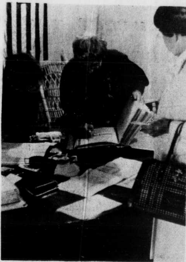
Voter turnout in precinct 3 was highest in county.