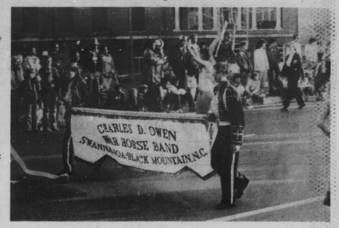
Owen High School Marching Band

Heading off the parade was the Salvation Army Food Float, collecting food from parade-goers for needy families for Thanksgiving and Christmas.