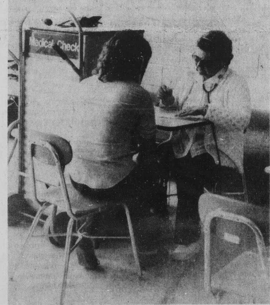
Red Cross volunteers recorded students' medical histories.

For more information concerning Town services, contact City Hall at