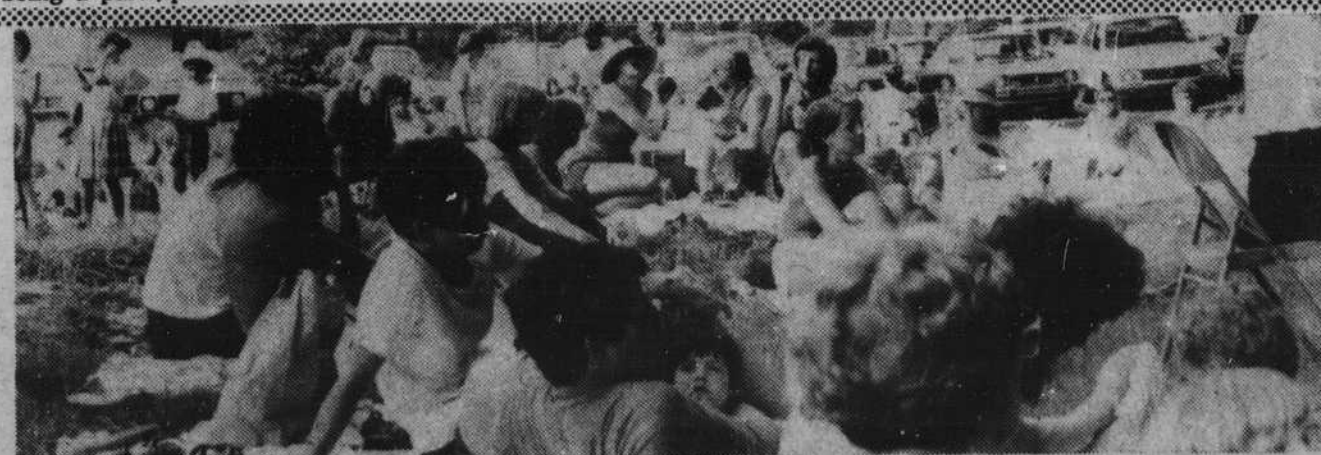
An audience of about 300 enjoyed the second Sunday in the Park at Lake Tomahawk last Sunday. Story on page 14.

The hike is sponsored by the Sourwood Committee of the Black Mountain-Swannanoa Chamber of Commerce