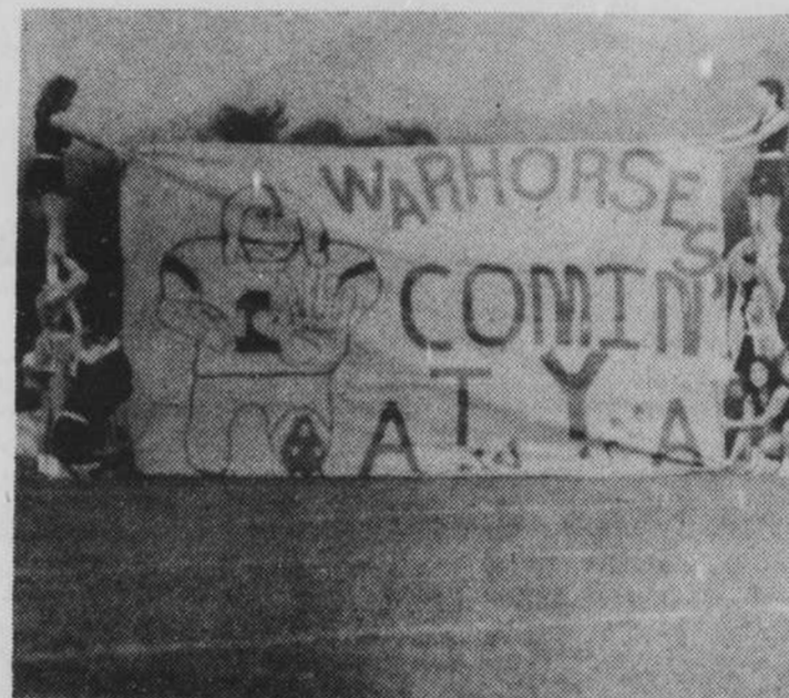
Although the Warhorses lost the season opener last week, their school spirit is never flagged.