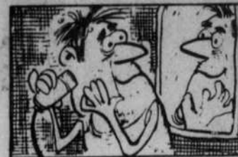
The first electric shavers were ready for sale in 1931.