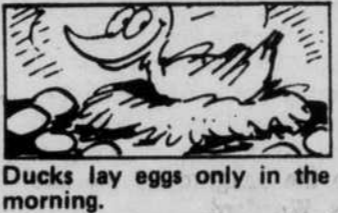
Ducks lay eggs only in the morning.