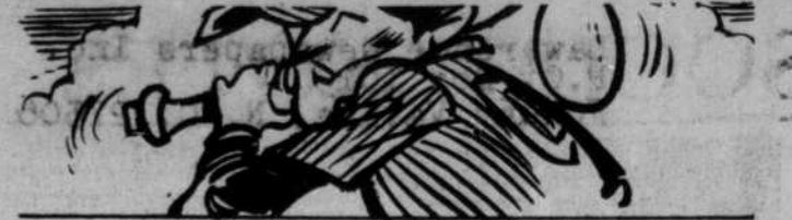
Heinie Groh, who played third base for the New York Giants in the 1920s, customarily used a bat shaped like a wine bottle.

Weekly weather courtesy of WFGW, Black Mountain. May 3—High 57, low 56 degrees; 17 in. precipitation. May 4—High 60, low 45 degrees; 20 in. participation. May 5—High 67, low 38 degrees. May 6—High 71, low 33 degrees. May 7—High 76, low 35 degrees. May 8—High 72, low 54 degrees; 32 in. precipitation. May 9—High 70, low 39 degrees. Dollar Store to have drawing The Black Mountain Family Dollar Store will have a drawing for a $50 gift certificate and a $20 gift certificate this Saturday, May 14. The person who wins the $50 gift certificate will be eligible for other prizes. No purchase is required to enter. Ask clerks for details.